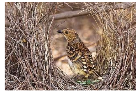
Cynthias Tree Kangaroos from Milanda. Robs Spotted bower bird from Bowra.